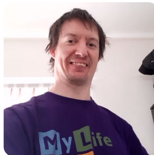
Celebrating Epilepsy Day