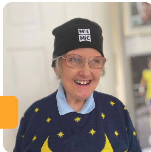
COVID-19 Mail Outs