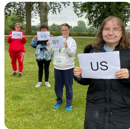
Making ourselves heard