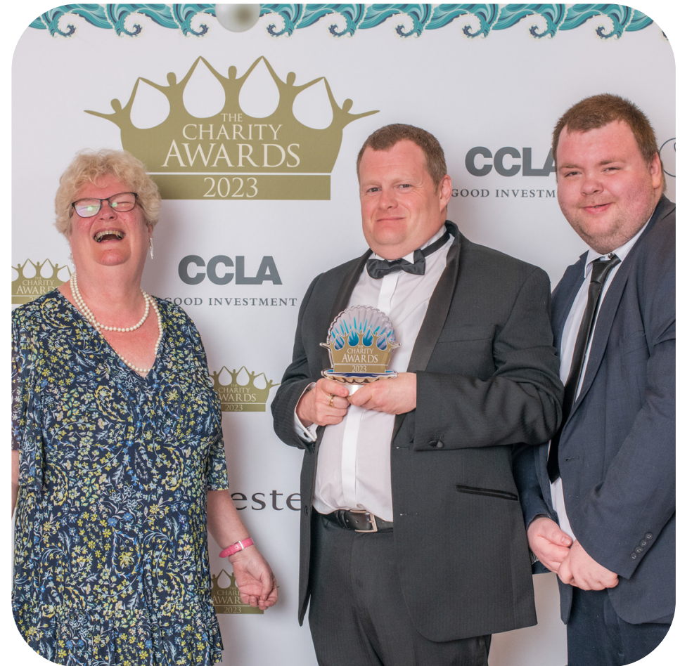
My Life My Choice wins Charity Awards 2023